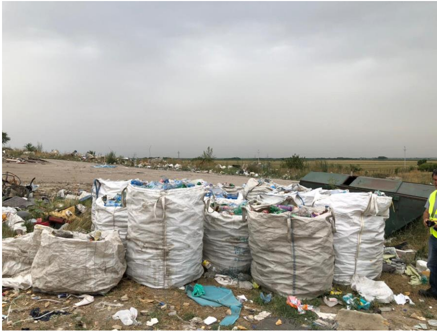
Figure 2 Site of the existing unsanitary landfill Rančevo

The RWMC Rančevo, which will consist of a sanitary landfill, a MBT and a sorting plant for plastic packaging waste, is within the jurisdiction of the city Sombor.