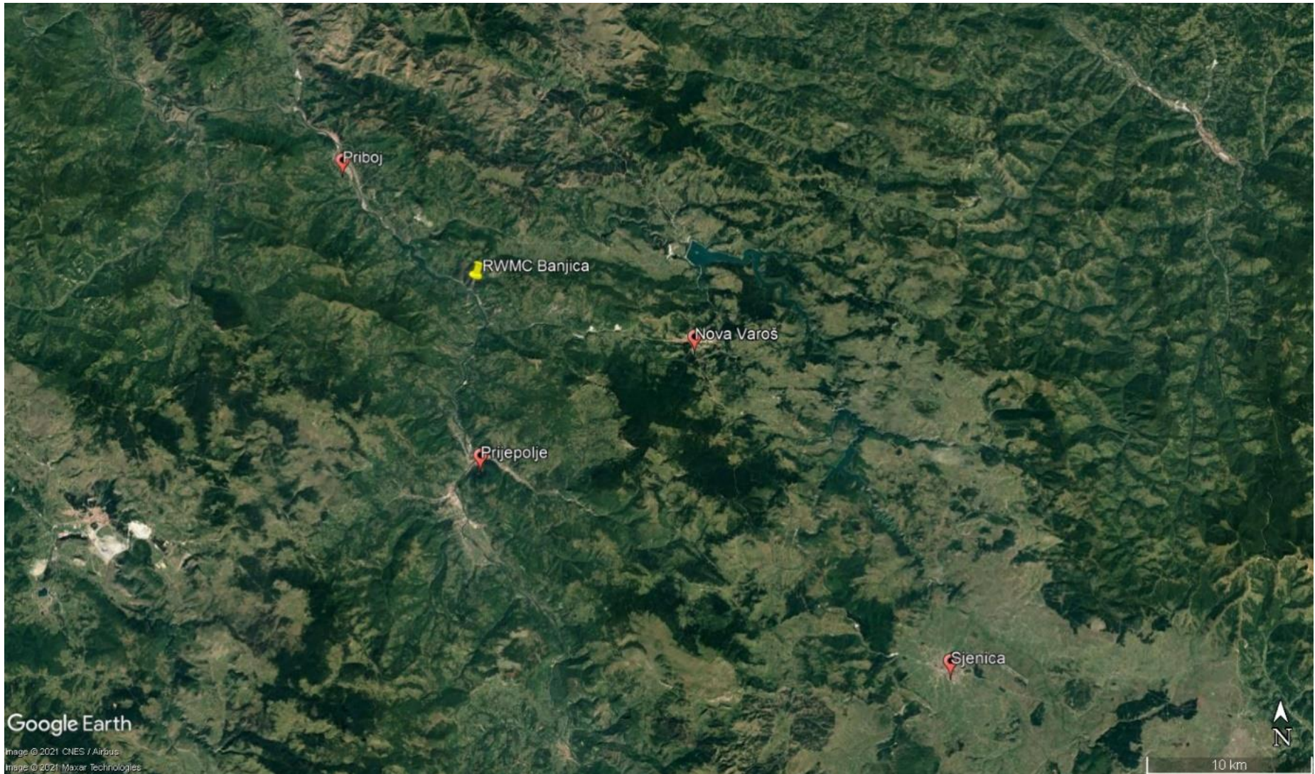
Figure 2 Overview of the location of waste sites