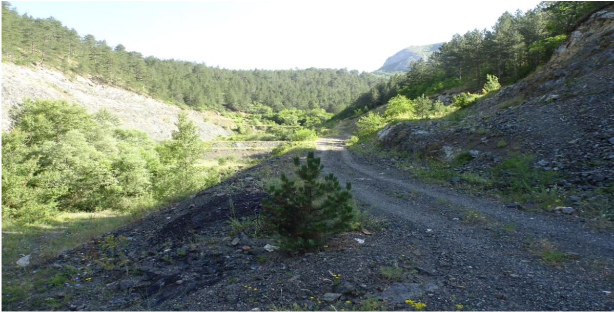
Figure 3 Site of RWMC Banjica (Site visit, July 2021)